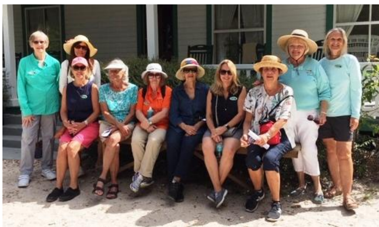
Our members enjoyed a tour of Historic Spanish Point