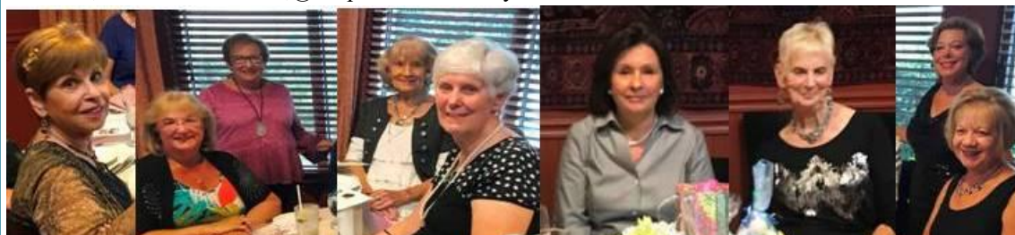
Our Golf Group met for a "End of Season" dinner at Stoneybrook Country Club on March 27 th .